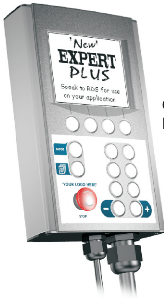
Graphic and Front Panel options on Expert Plus.